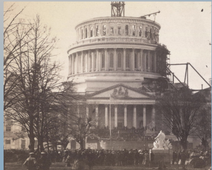
US Capitol building, 1861

“I have no purpose, directly or indirectly, to interfere with the institution of slavery in the States where it exists. I believe I have no lawful right to do so, and I have no inclination to do so.”