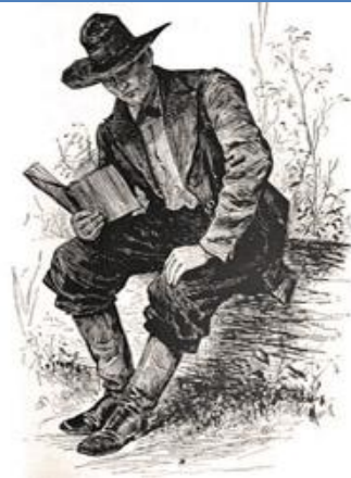
Lincoln as a Rail-Splitter Illustration, 1884