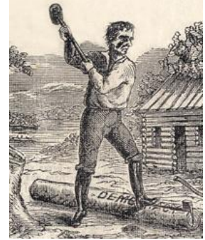
Detail of the masthead The Rail Splitter , 1860

Shortly after the [1860 Illinois Republican] convention opened, the "tall, massive, handsome" Richard J. Oglesby, a rising political star from Decatur, interrupted the proceedings by announcing: "I am informed that a distinguished citizen of Illinois, and one of whom Illinois ever delight to honor, is present." The 3000 auditors in the makeshift 900-seat convention center impatiently waited for this man to be identified. When Oglesby finally shouted, "Abraham Lincoln," the crowd roared its approval and tried to jam Lincoln, who had been sitting in the rear of the hall, through the densely packed crowd to the stage. Frustrated by their failure to penetrate the throng, they hoisted him up and passed him "kicking scrambling – crawling – upon the sea of heads between him and the Stand." When he reached that destination, half a dozen delegates set him upright. "The cheering," reported an observer, "was like the roar of the sea. Hats were thrown up by the Chicago delegation, as if hats were no longer useful." Lincoln, who "rose bowing and blushing," appeared to be "one of the most diffident and worst plagued men I ever saw." With a smile, he thanked the crowd for its expression of esteem.