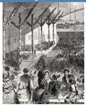
Inside the "The Wigwam" Chicago, Illinois, 1860

The convention opened on Wednesday, May 16, with David Wilmot of Pennsylvania serving as temporary chairman. Orville Browning called him "a dull, chuckle headed, booby looking man" who "makes a poor presiding officer." The convention hall, specially built for the occasion, was known as the Wigwam because it resembled an Indian longhouse. A large, clumsy, solid, barn-like structure, measuring 100 x 180 feet, with a capacity of twelve thousand people, it was constructed "of rough timber, decorated so completely with flags banner, bunting, etc., that when filled it seemed a gorgeous pavilion aflame with color and all aflutter with pennants and streamers." The interior resembled a