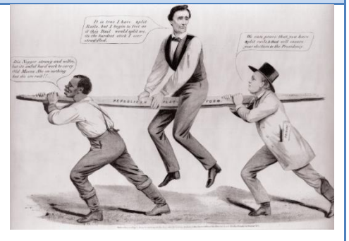
"The Rail Candidate," cartoon, 1860

An "overflowing heartiness and deep feeling pervaded the whole house," John G. Nicolay remembered. "No need of a claque, no room for sham demonstration here! The galleries were as watchful and earnest as the platform. There was something genuine, elemental, uncontrollable in the moods and manifestations of the vast audience." The city was awash with visitors, some of whom wound up sleeping on tables at billiard parlors. The first two days were devoted to routine business and to adopting