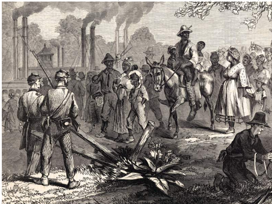
Enslaved people seeking refuge behind Union lines