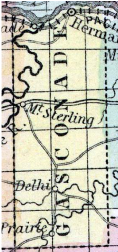
Gasconade county, Missouri (House Divided Project)