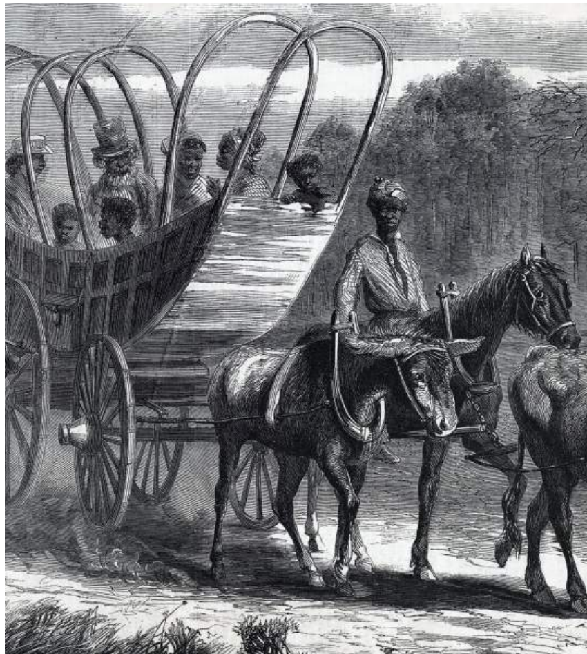
Freedom seekers set out for Union lines.

DATELINE: NEAR FALL CREEK, ILLINOIS, MARCH 23, 1863