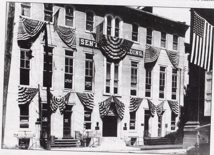
1924 view of the Sentinel Building, formerly Rheem's Hall, Court House Avenue, Carlisle.