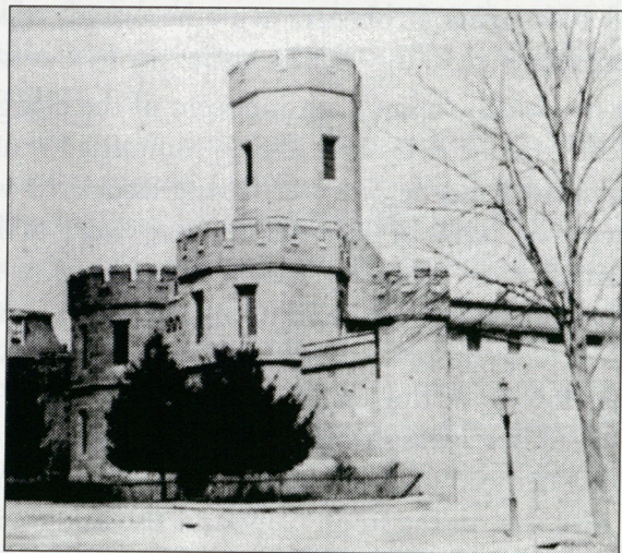
Early view of Cumberland County Jail